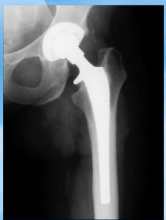
Stainless Steel Castings for Orthopaedic Implants