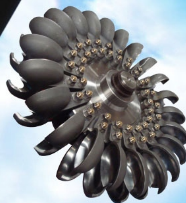
Stainless Steel Castings For Hydro Power Turbine