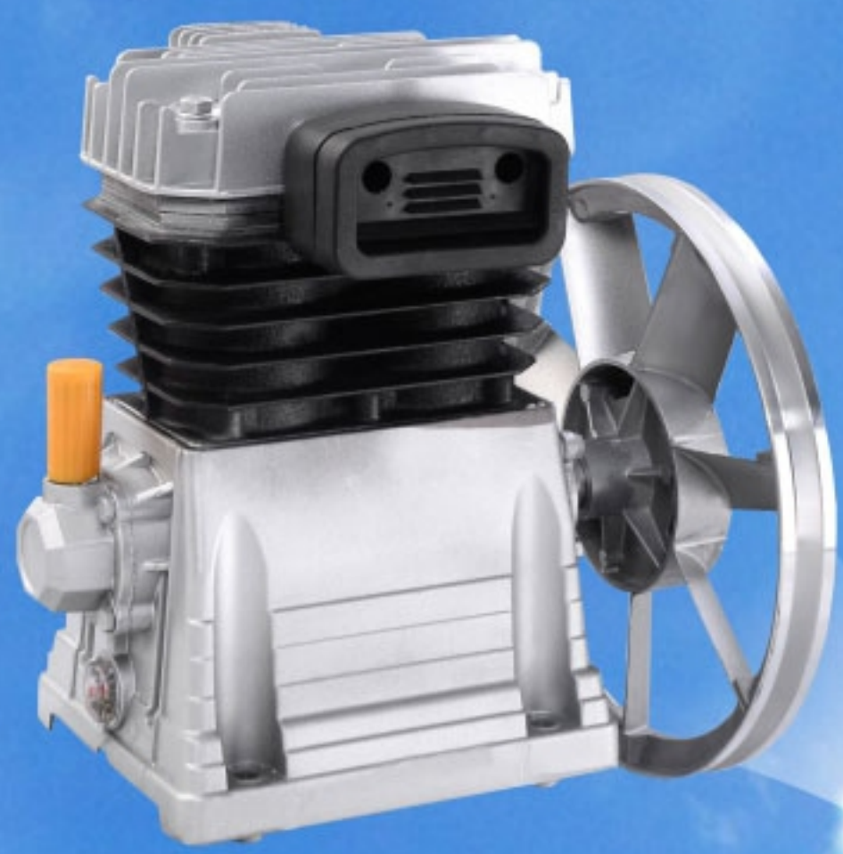
Precision Machined Castings for Compressor