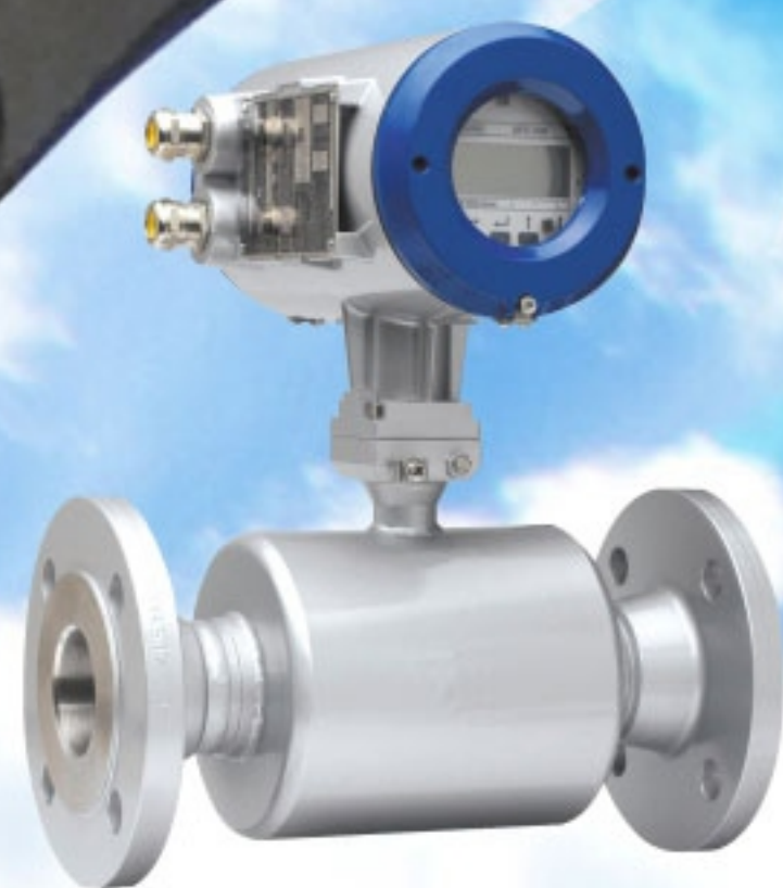
Stainless Steel Castings for Flow Meter