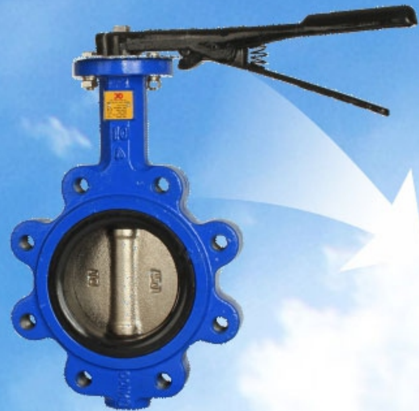
Stainless Steel Castings for Valves