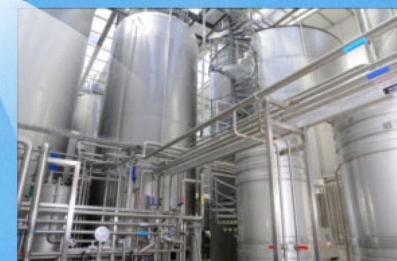
Stainless Steel Casting for Process Equipments