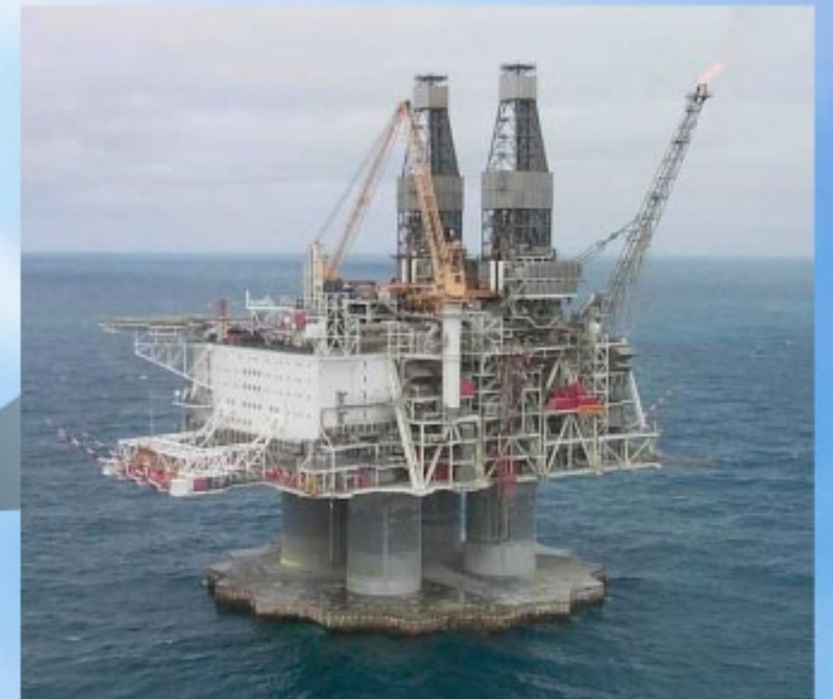
Steel Castings for Oil & Gas Industry