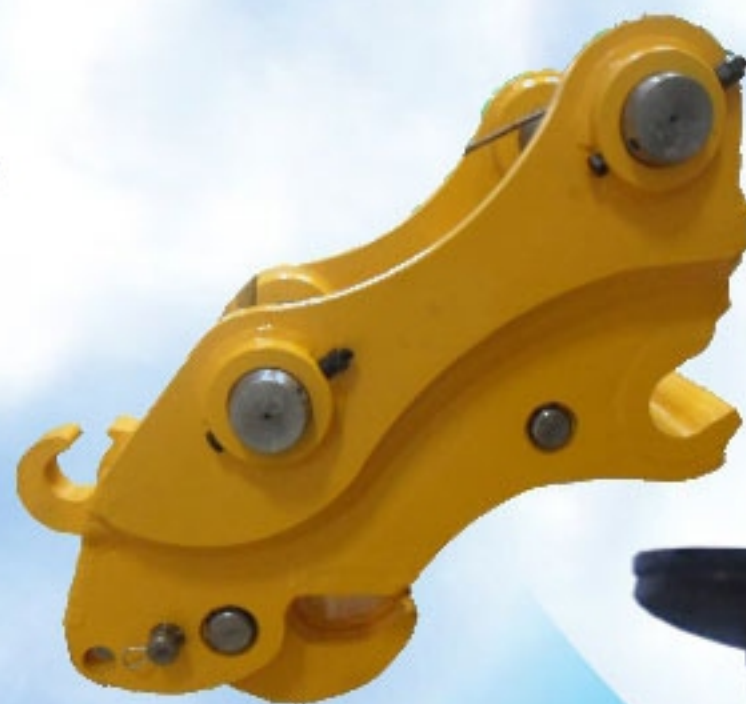
Steel Castings for Quick Coupler Equipments