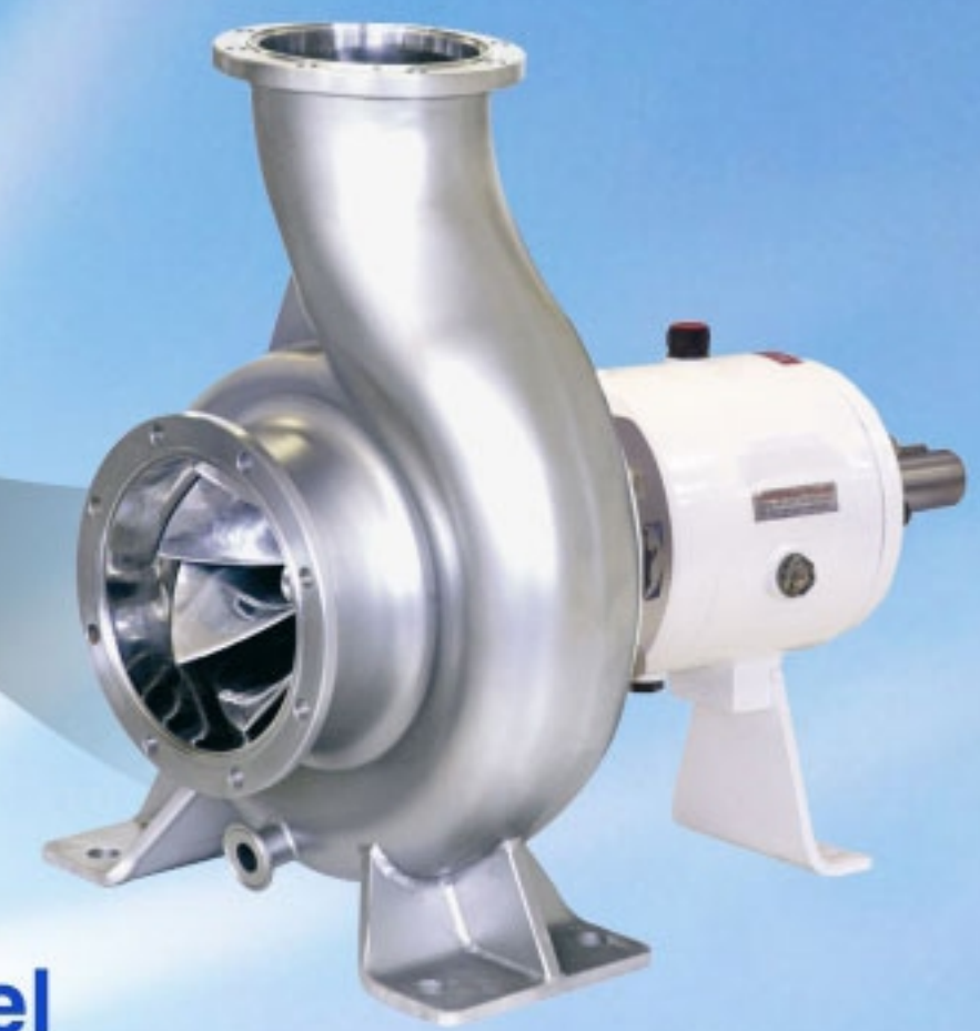
Stainless Steel Impeller for Pump Industry